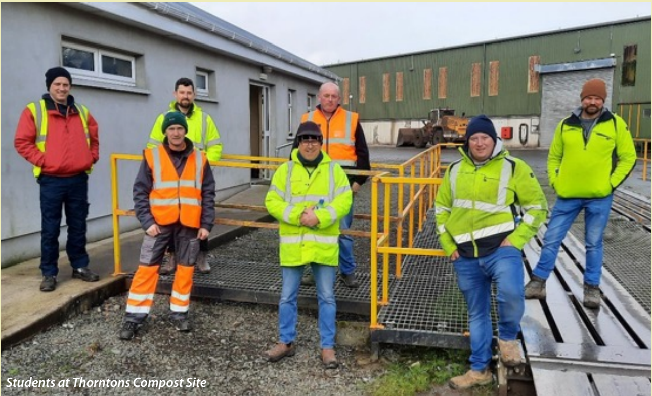
Students at Thorntons Compost Site

Some of the students on the Certificate in Compost Facility Operation visit to Thorntons's Kilmainhamwood compost plant. The course was primarily conducted in 2021 and the students got their results in the year- well done to all who passed. The course is a continued partnership with Atlantic Technological University Sligo.