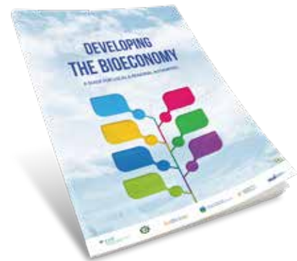
A Guide for Local Authorities was also published